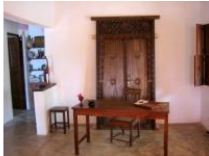
Writing Place in the Livingroom